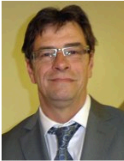
Mayor Roger Larose